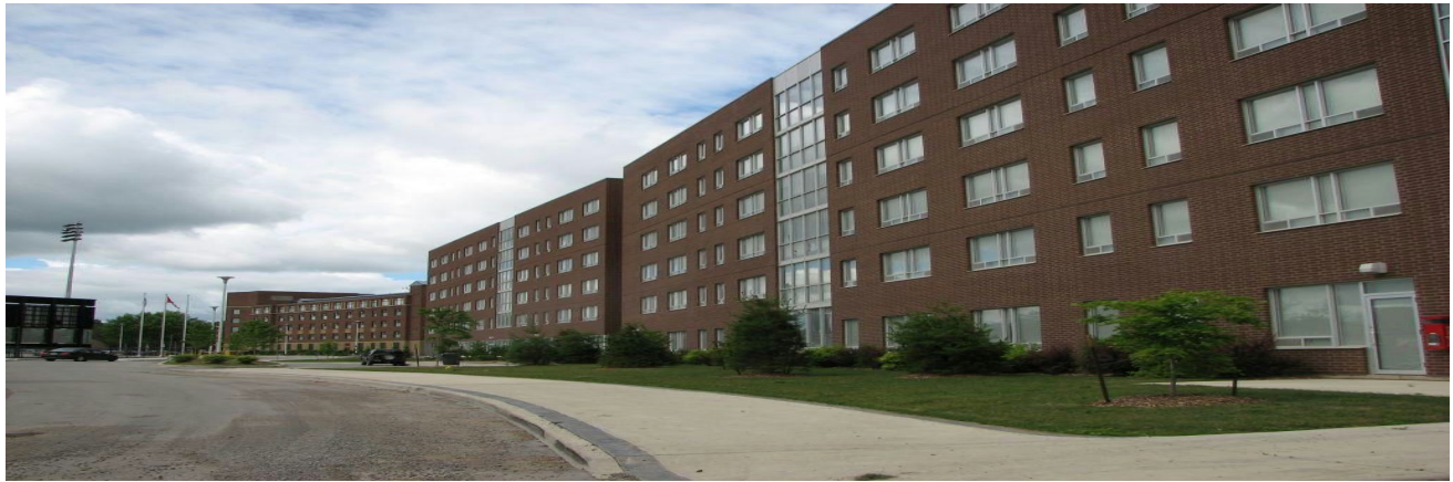
LES PRINCE HALL